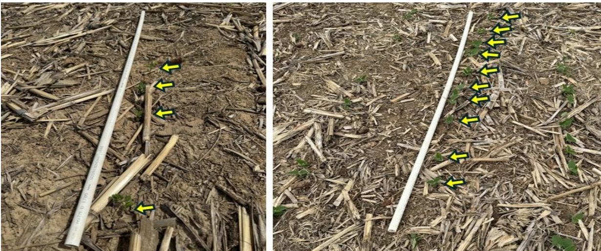
Figure 1. Photos of 5-ft rows in two soybean fields showing the reduction of plant stands caused by slug feeding: 4 plants (left) and 10 plants (right), shown with yellow arrows, in center rows. Under normal conditions, there should be 20 to 30 plants per 5-ft row.

In soybean fields heavily affected by slugs, plant stands of 2 to 10 plants per 5-ft row are in contrast to normal stands of 20 to 30 plants per 5-ft row (based on average plantings in Kentucky: 5 to 6 seeds per foot-row planted in 20" row width) (Figure 1). Damage observed in fields showed that slugs were feeding on unsprouted seeds and emerging seedlings (Figure 2). Also, observations since the first week of April have shown that eggs were laid in moist soils covered by organic matter from the previous crop (soybeans, corn, or wheat). Figure 3 shows that slugs were well protected under dry brace roots of corn, ovipositing eggs under these structures.