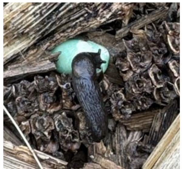
Figure 2A. Slug feeding on pesticide coated, swollen, and unsprouted soybean seed.

There is no rescue treatment for slug damage or thresholds for application of molluscicides. If stands are low, replanting is recommended, and an application of molluscicides may be necessary. On February 27, 2024, we wrote a KPN article ( Slugs are Active in February 2024, but Farmers Have Two Registered Molluscicides under Section 24(c) in Kentucky ) that discussed the possibility of abundant mollusks during corn and soybean germination periods. This was based on environmental conditions and mentioned two metaldehyde molluscicides that are registered under the Section 24(c) for soybeans and corn in Kentucky: Deadline® M-Ps™ and Slug-Fest®. In addition to these two products, Table 1 shows additional molluscicides that can be used in corn and soybeans for management of slugs or snails.