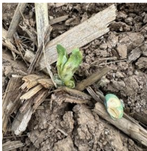
Figure 2B. Feeding damage on emerged and unsprouted seed.